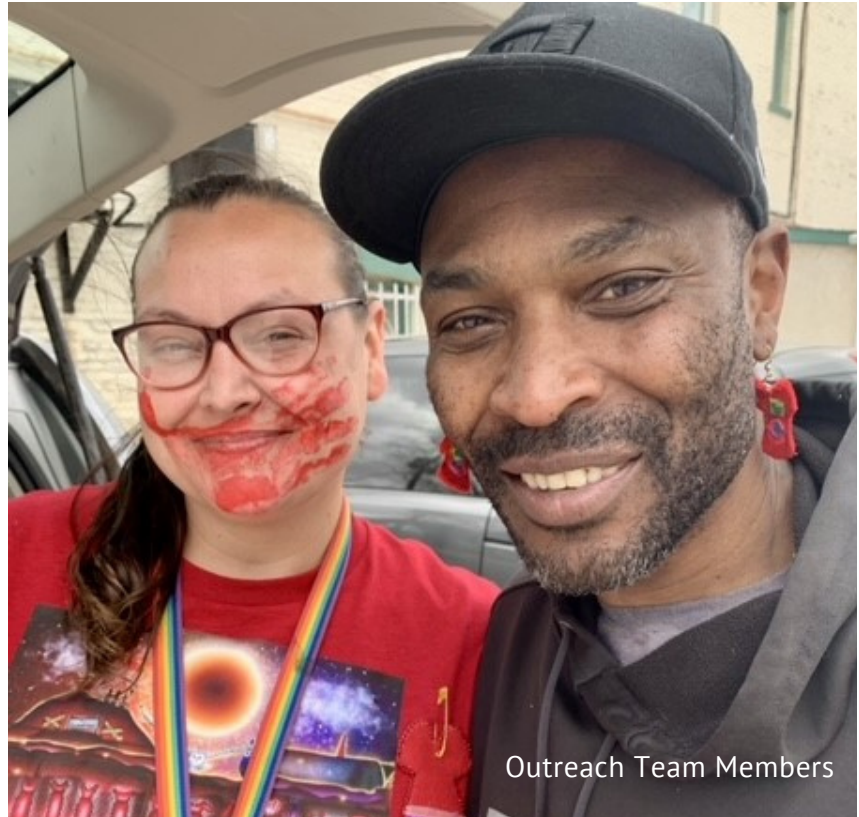
Outreach Team Members